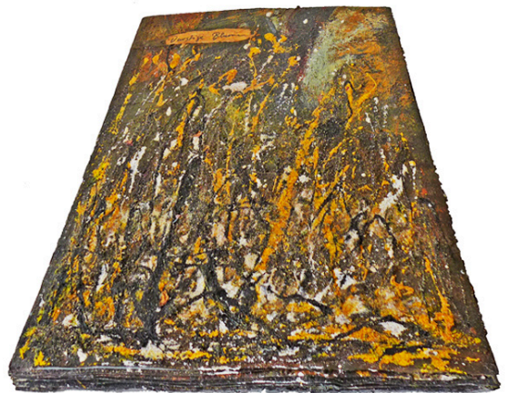
Left Bottom: Durstige Blumen / Thirsty Flowers I , mixed media on canvas, 24" x 46", 2015