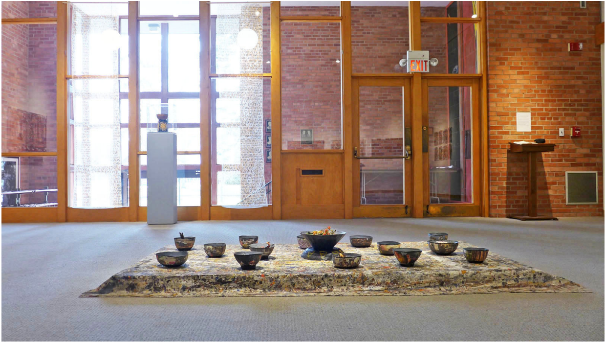
Installation: Offerings to Nature , mixed media, 12' x 8', Mills Gallery, Pella, Iowa, Solo Exhibition, 2015 Below: Detail, Papermache bowls : mixed media and collage. Each bowl represents a present conflict