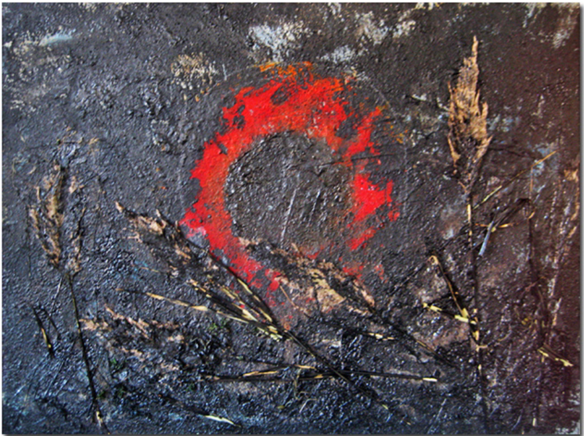
Oil Spill: Elegy to the Marshes , mixed media and plants on canvas, 60"x36"