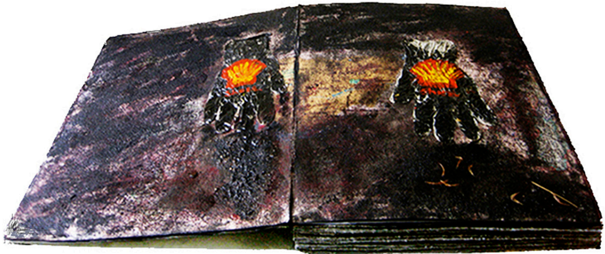
Oil Spill Book III: Elegy to Nigeria , Unique Book, mixed media on paper, 19 1/4" x 14" book closed, 24 pages, page1+2 and 4+5 right