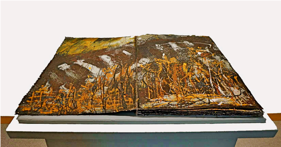
Top and Bottom: Durstige Blumen / Thirsty Flowers , Unique Artist Book: mixed media on canvas, 22" x 15", 2015 /2016