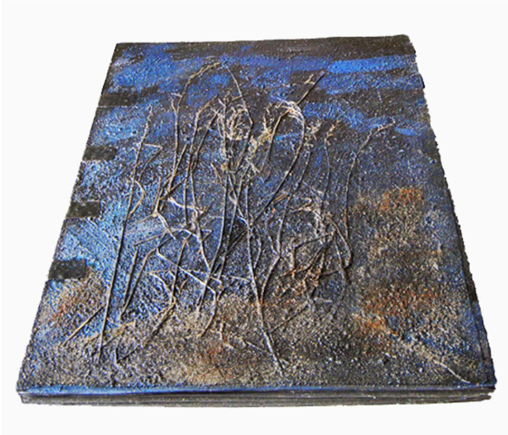
Oil Spill Book II: Elegy to the Marshes , Unique Book, mixed media on paper, 19 1/4" x 14" book closed, 24 pages, Top: cover Right: pages 4+5