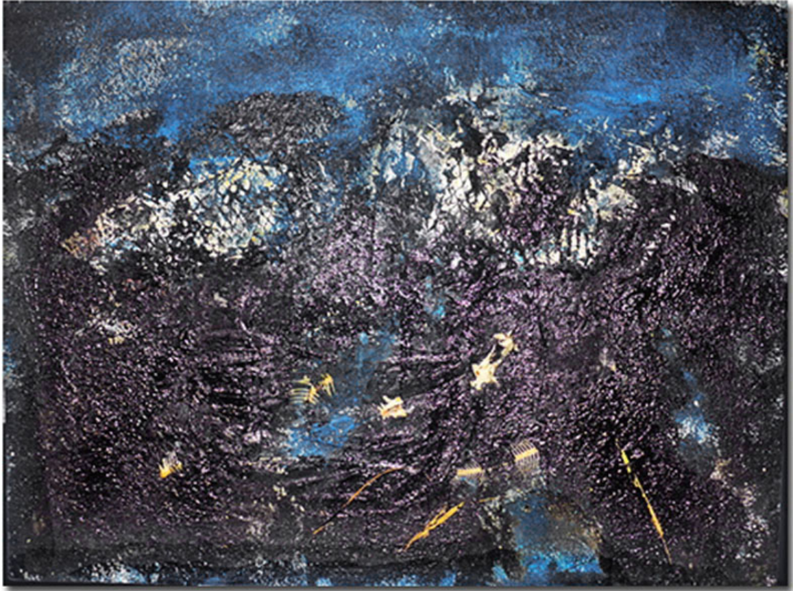
Oil Spill: Elegy to the Sea , mixed media, sand and objects on canvas, 36"x 60"